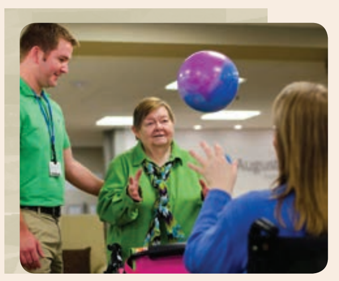
Joining with Volunteers of America will strengthen Centrex Rehab's ability to serve more patients, residents and clients than ever before.