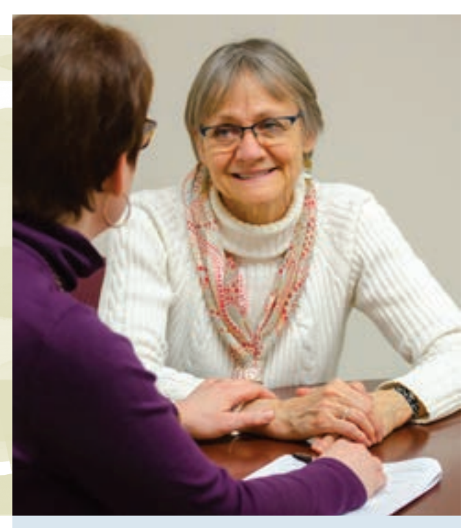
The new space at Augustana Open Circle gives us more room to provide consultations to caregivers.

What's new at Augustana Open Circle? We expanded our space to accommodate new services for caregivers and people in the early stage of conditions like Alzheimer's. A grant from the Minnetonka Rotary Club helped support this effort.